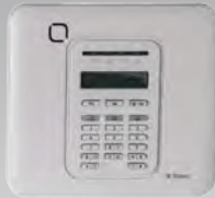
PowerMaster-10 Triple 30-zone control panel