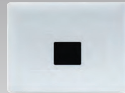
PowerMaster-33 EXP Distributed wireless alarm control panel