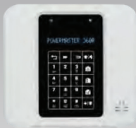
PowerMaster-360R Wireless Alarm and Home Automation Gateway