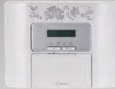
PowerMaster-30 64-zone control panel