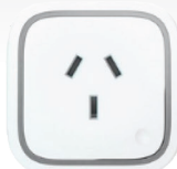
Light & Appliance

Everything connected in a single experience.